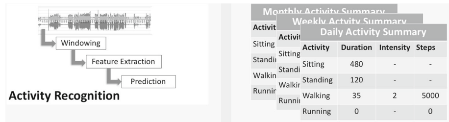
Fig. 3 A wearable system for constant activity profile generation, using motion measured with an accelerometer and gyroscope